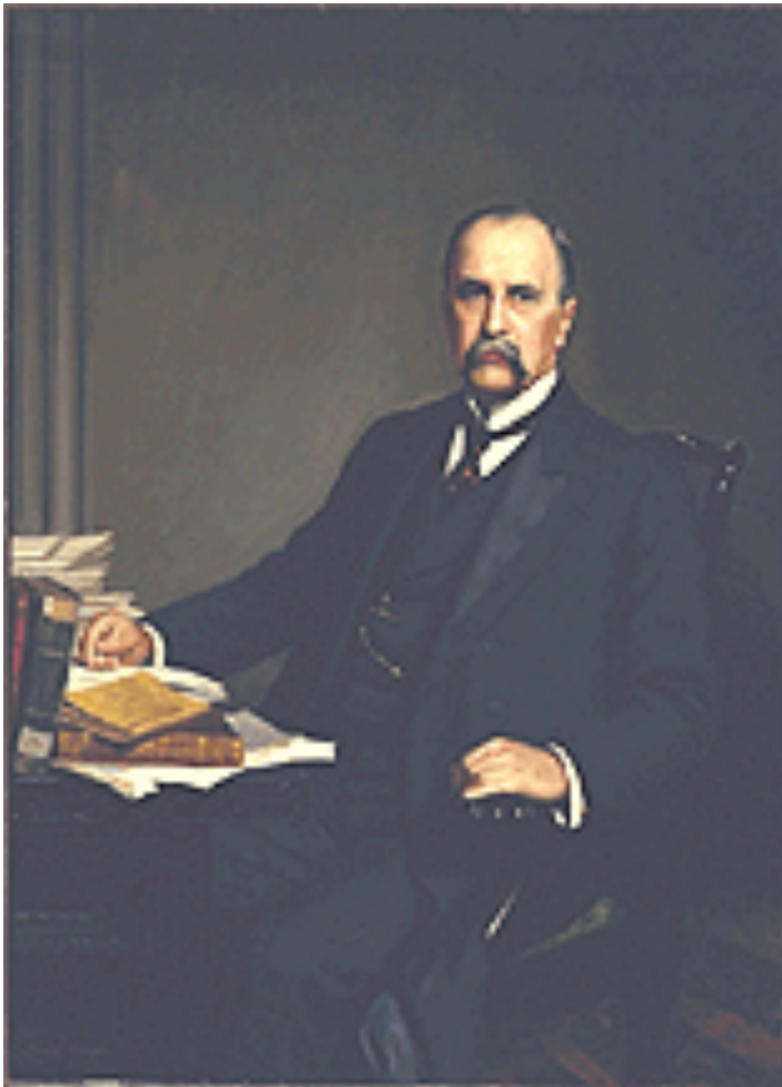
Sir William Osler, M.D.